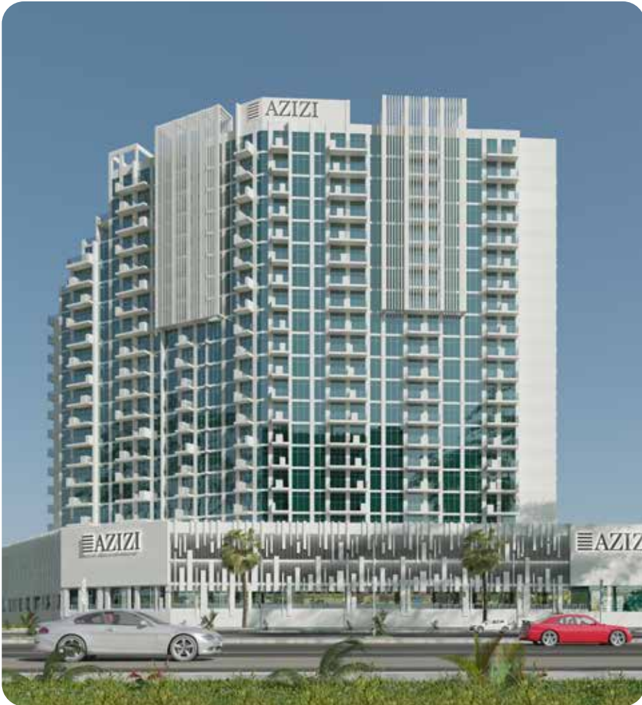
Creek View Azizi