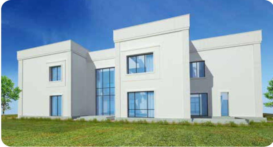
SEC EO Villa